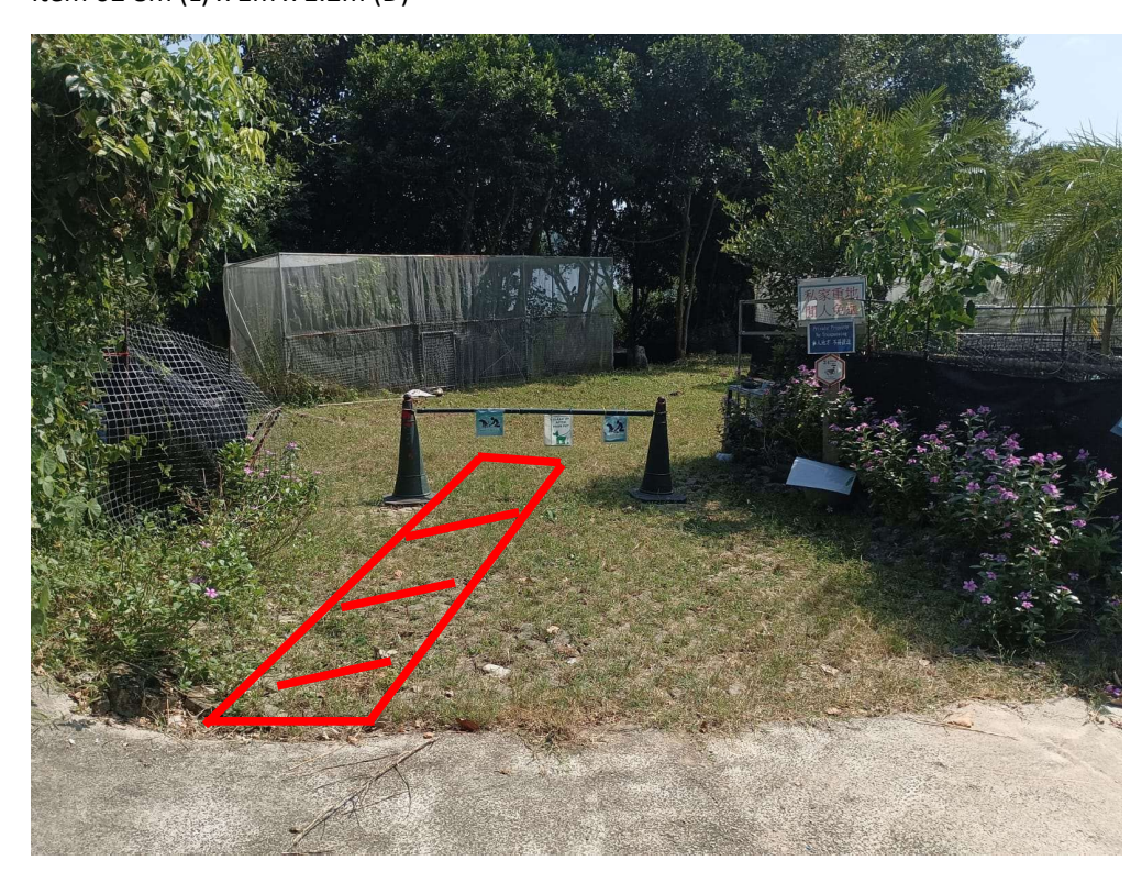
Item 02 8m (L) x 1m x 1.2m (D)